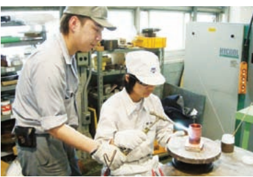
A practical work experience session

Having received a request from the Nishi-ku Ward Office (Yokohama) to provide work experience placements, in May 2008 we organized a two-day work experience program for two local junior high school students. The program started with safety education and also included tours of our plants before concluding with practical sessions in which the students manufactured their own pencil holders.