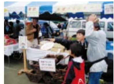
Booth at Yawata Coastal Area Fair