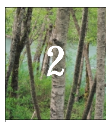
Products that Contribute to Prevent Ozone Layer Depletion

Since these cable conduits contain no halogen-based flameretarding agents, they do not emit dioxins nor halogenous gases when combusted, permitting easy recycling.